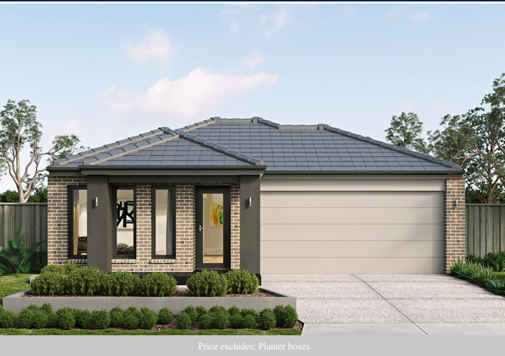
Price excludes: Planter boxes